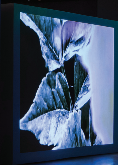
Anne Colvin, A Granite Note installation view, 2014.