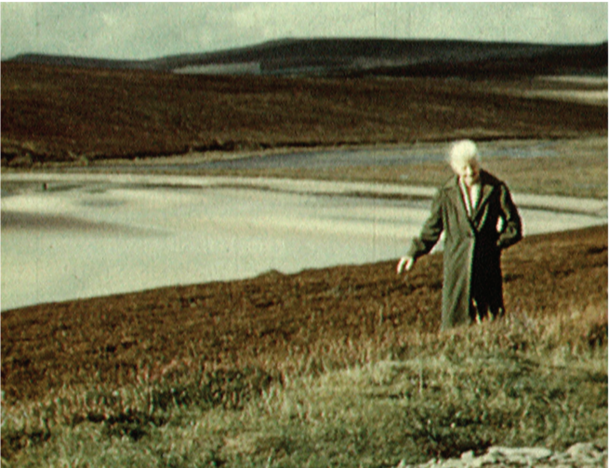
Margaret Tait, film still from Portrait of Ga , 1952.

Tait's watchful eye is consumed with small but meaningful details, whether it be a close-up of her mother's wrinkled hands removing the wrapping from a piece of candy in Portrait of Ga or the synchronized movement of people's legs as they march to work in Where I Am Is Here , her impressionistic exploration of everyday Edinburgh. Colvin's work utilizes a similar strategy of capturing small gestures and movements that are at once intimate and monumental.